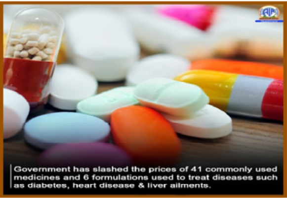
Government has slashed the prices of 41 commonly used medicines and 6 formulations used to treat diseases such as diabetes, heart disease & liver ailments.

The Government has slashed the prices of 41 commonly used medicines and six formulations used to treat diseases such as diabetes, heart and liver ailments. The decision was taken at the meeting of the National Pharmaceutical Pricing Authority NPPA in order to ensure that the cost of essential medicines